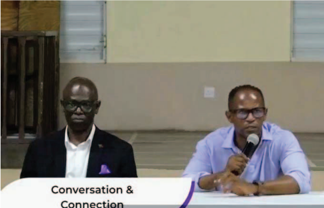
Conversation & Connection