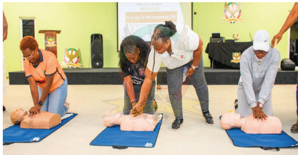
Some of the participants in the SKNFA Safeguarding and First Aid Training Workshop at the National Bank Group Technical Center being trained in CPR.

This safeguarding workshop was a cornerstone of a weekend-long developmental program designed to strengthen the infrastructure of the women's game. These efforts serve as the final preparation phase for the highly anticipated 2026 Elvis Star Browne Women's League, which is set to kick off later this month.