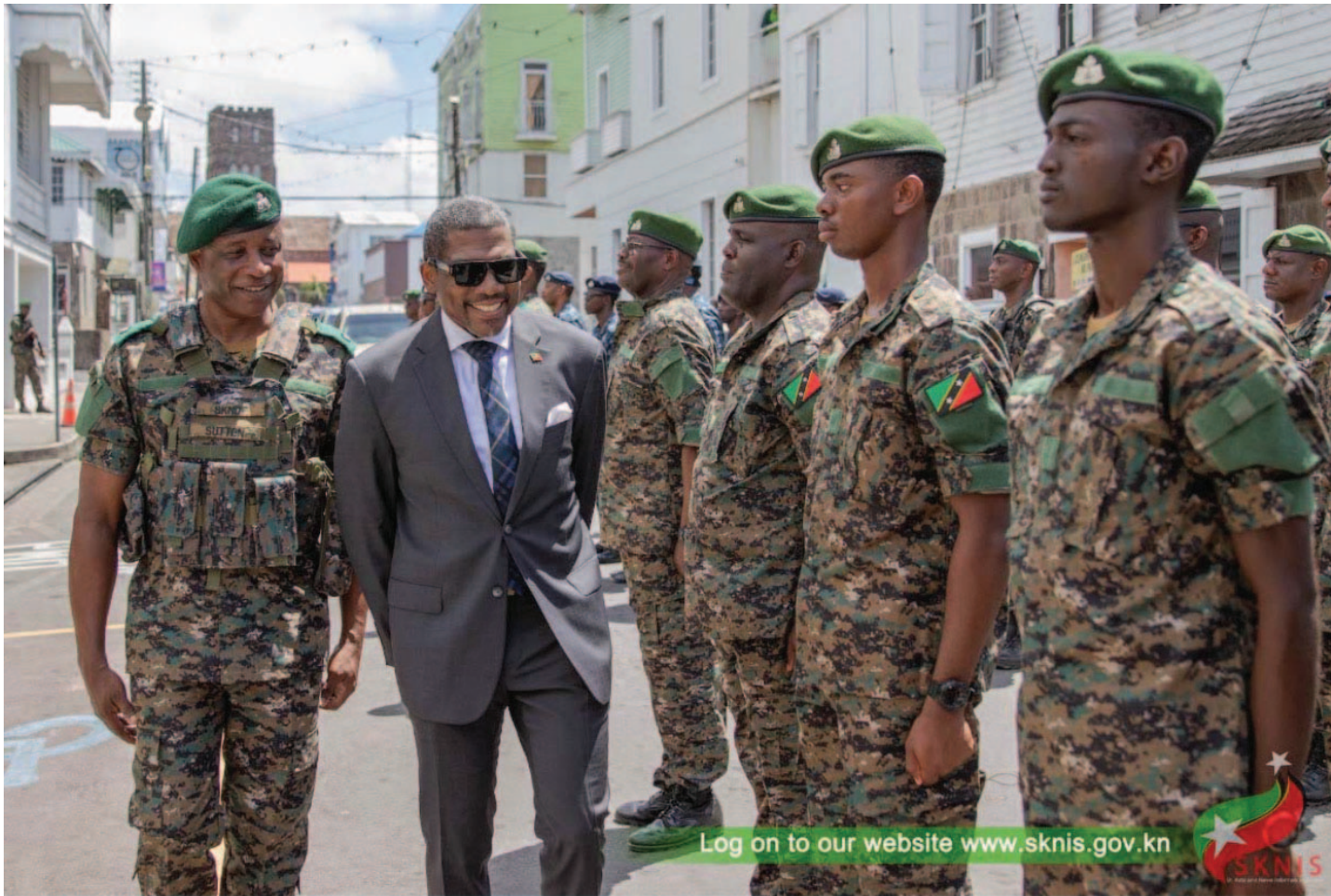
Log on to our website www.sknis.gov.kn

The Prime Minister concluded by encouraging citizens to honour and support the members of the Defence Force whose service helps safeguard the Federation's peace, security and democratic traditions.