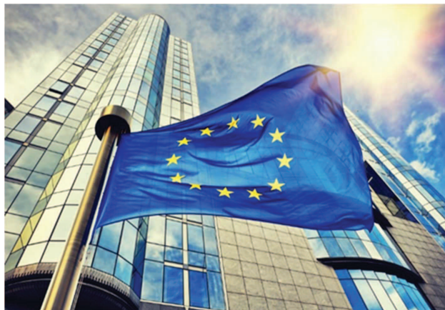
EU flag at EU HQ, Brussels.

Tracker tool provides insight into bilateral engagement.