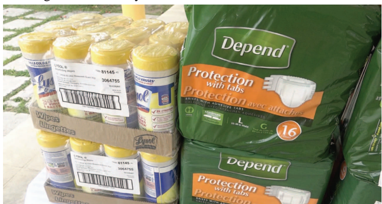
Some of the gift items donated by Nevis Dental Clinic on June 16, 2022 for the care of residents of the Flamboyant Nursing Home