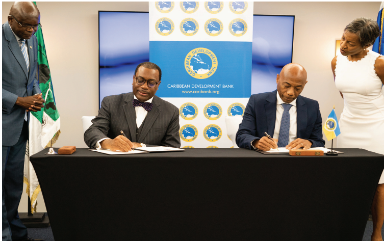
CDB and AfDB sign memorandum of understanding to join forces to promote trade between Africa and the Caribbean.

June 15, 2022, PROVIDENCIALES, Turks and Caicos Islands - The African Development Bank Group and the Caribbean Development Bank strengthened their collaboration this week with the signing today of a memorandum of understanding (MoU) in Providenciales, Turks and Caicos Islands.