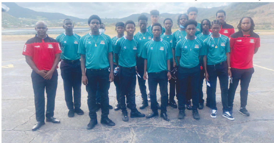
Members of the St. Kitts and Nevis Under 20 team and coaching staff at the RLB International Airport before departing the Federation on Monday to Honduras.