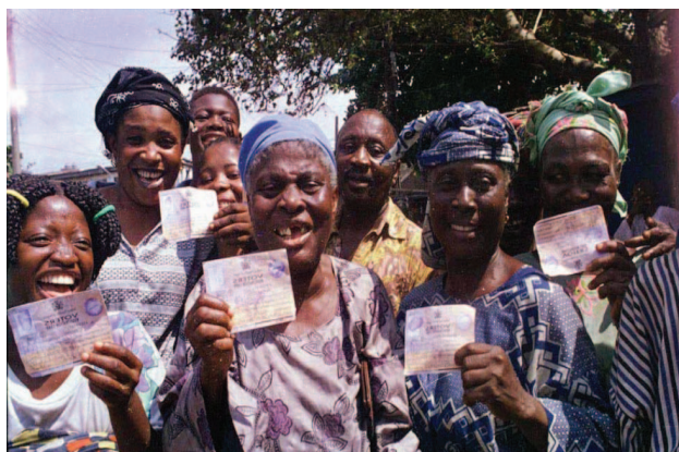
Some Nigerian women displaying their voter cards at a polling units during one of the country's elections.