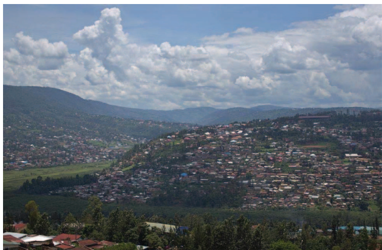
6 April 2014: A view of Kigali, capital of Rwandan capital, from one of the overlooking hills.

Expectations are high in Rwanda as the East African nation prepares to host The Commonwealth Heads of Government Summit in June 2022.