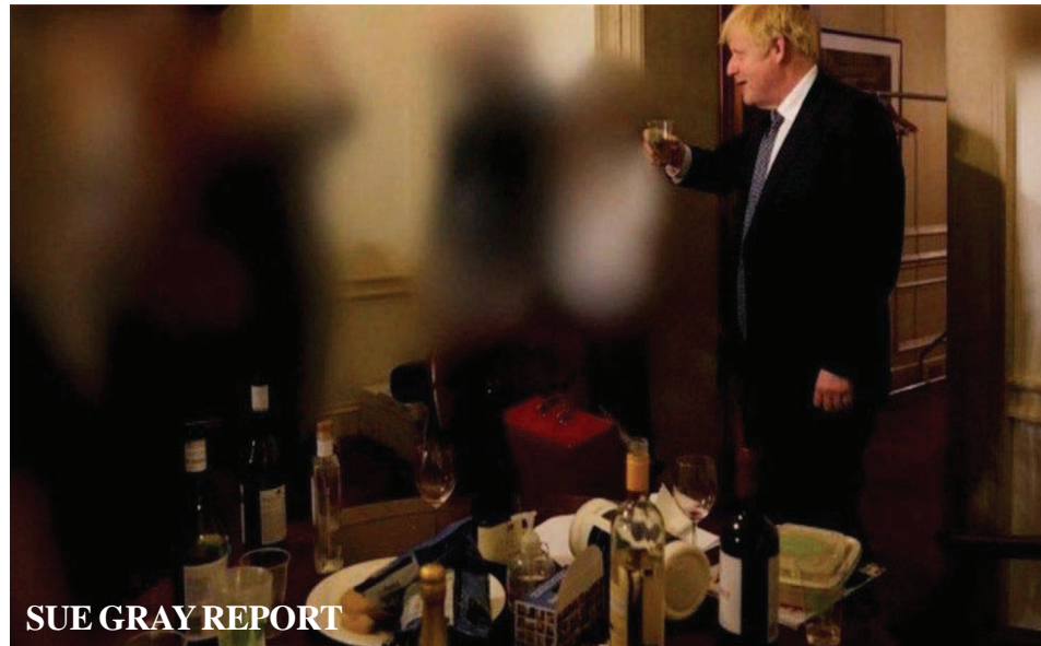
Mr Johnson pictured at a leaving party in November 2020

Downing Street said Mr Johnson was reviewing whether or not to fill the vacant position, and declined to comment on suggestions the plan related to maintaining tariffs on Chinese steel despite possibly breaching World Trade Organisation (WTO) commitments.