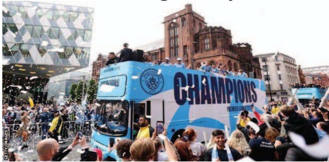
Manchester City and Paris St-Germain have been attacked by La Liga president Javier Tebas

the football eco-system in Europe,” said La Liga president Javier Tebas.