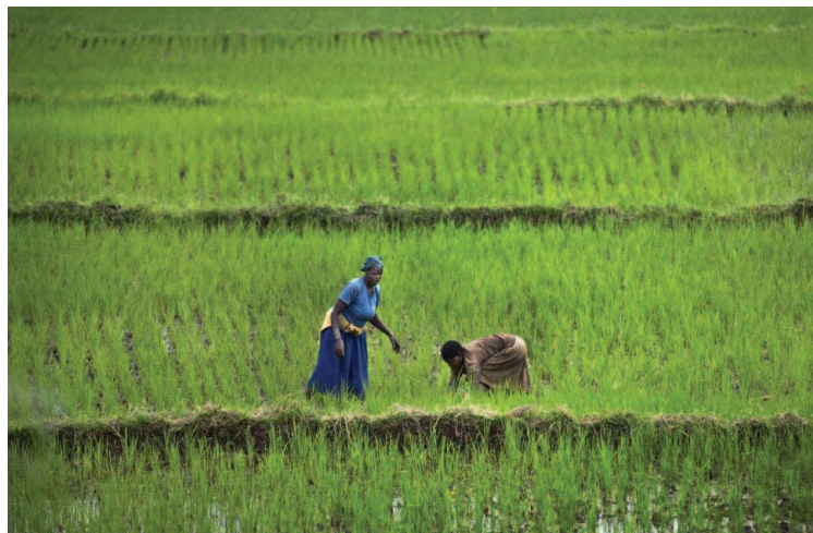
27 March 2014: Women observed weeding their rice paddies in a valley near Kirehe in eastern Rwanda.

Rwandan authorities said they would spend roughly $10 million improving infrastructure ahead of the summit, which was initially scheduled to happen in 2020, but was delayed due to the COVID-19 pandemic.