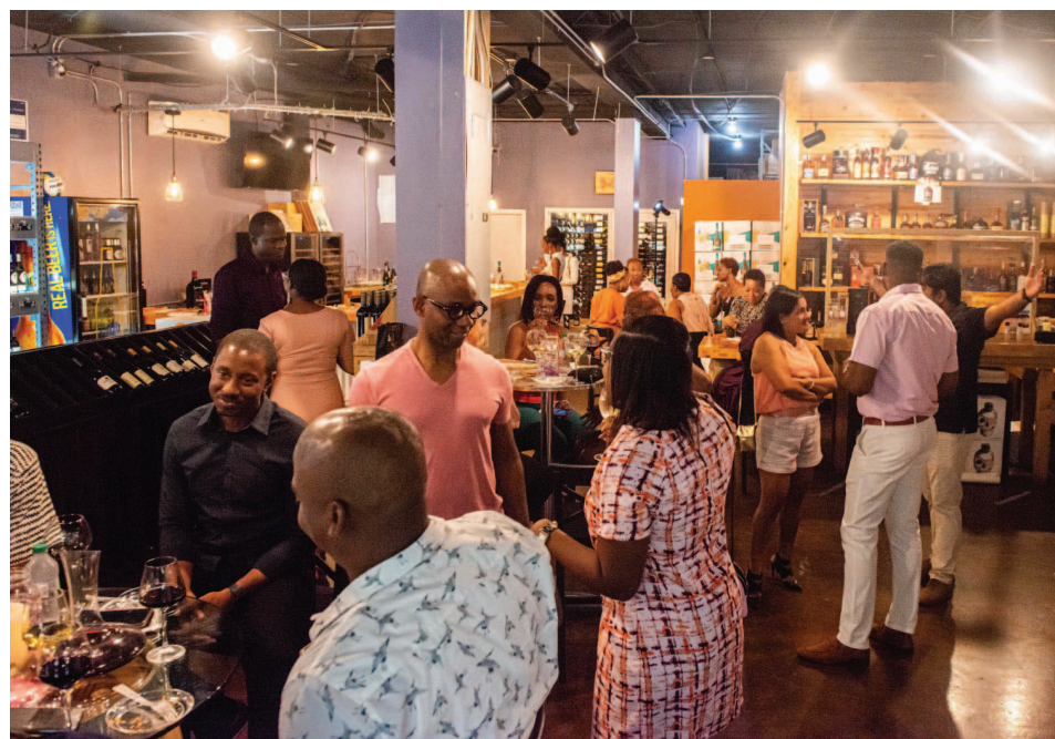
Wine and Tapas event