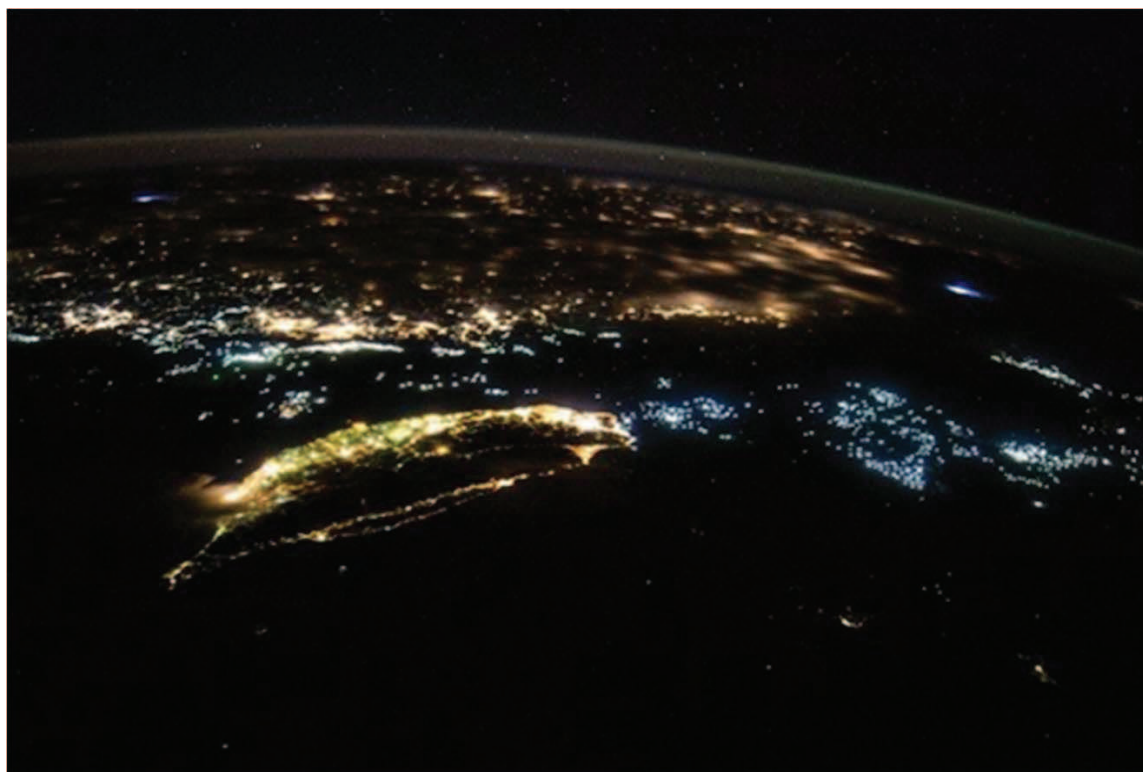
Taiwan at night as seen from outer space.

By William Stanton, Contributing Columnist