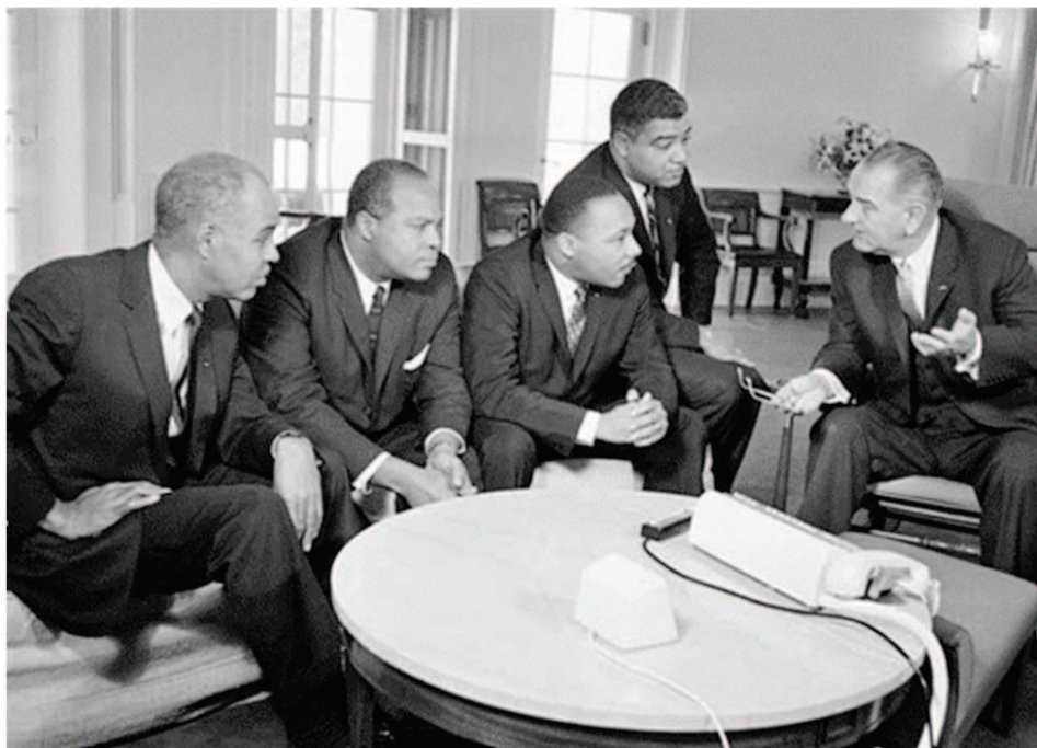
President Lyndon B Johnson, right, as he spoke with Dr Martin Luther King Jr and other civil rights leaders in his White House office in Washington DC on 18 January 1964.