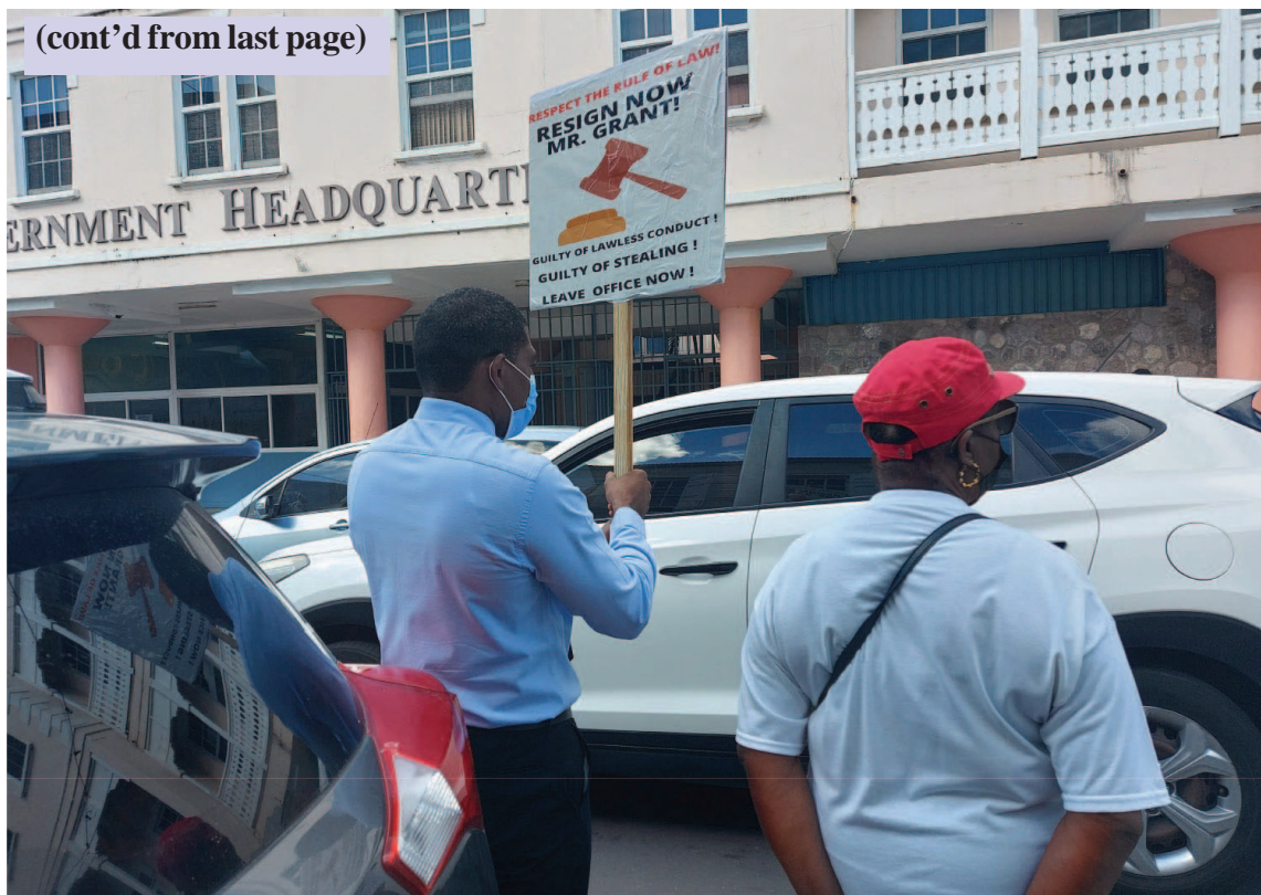
Leader of the St.Kitts-NevisLabour Party (SKNLP) Dr. Terrance Drew, while in protest mode, is joined by a female senior citizen wearing a shirt with the writings ‘SPEAK UP,SUPPORT, STAND FIRM’