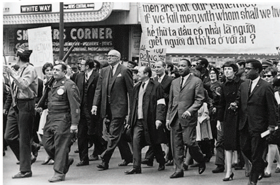
Martin Luther King Jr. as he led the march against the Vietnam conflict in a parade on State Street in Chicago on 25 March 1967.

By 1967 King's vision of justice was one of flourishing for all people, not only civil rights for African Americans. King was criticized for expanding his vision beyond civil rights for Black Americans. Some worried that aligning with the peace movement would weaken the civil rights movement. The National Association for the Advancement of Colored People even issued a statement clearly opposing what it saw as a merging of the civil rights and peace movements.