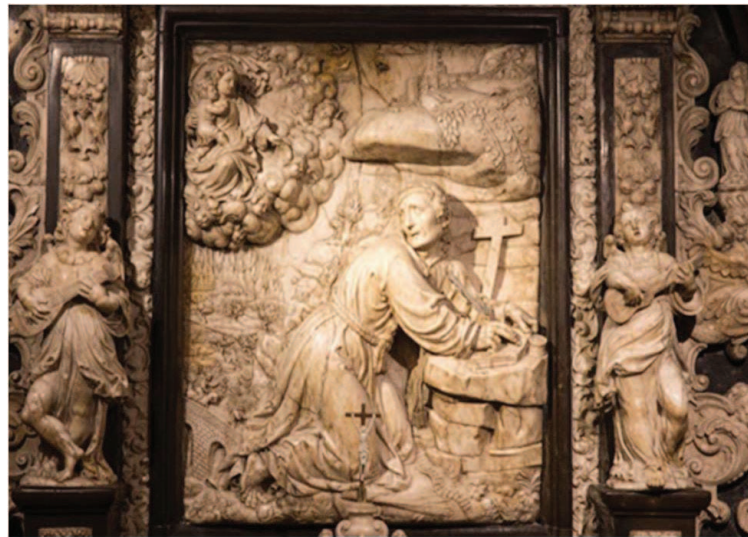
The cave in Manresa, Spain where Saint Ignatius is said to have prayed from March 1522 to February 1523 and wrote his spiritual exercises.

In the sharing of his story, Ignatius does not want his biography to become the center of attention. He provides an example of moving beyond the isolated facts of his life journey to reflect about their interconnected meaning and a way of looking beyond.