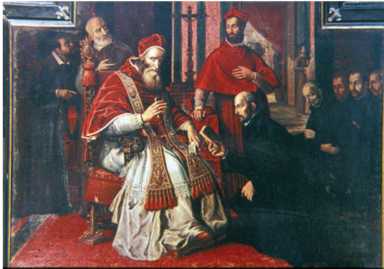
Saint Ignatius of Loyola with Pope Paul III.