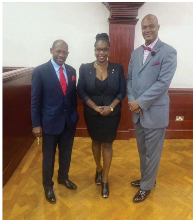
Rt. Hon. Dr. Denzil L. Douglas, Hon. Joyelle Clarke and Hon. Dr. Geoffrey Hanley at the St Kitts and Nevis National Assembly

ascent." He implored the membership of the SKNLP, a great and unique political movement, "can only do so together, each for the other, so that we do not waste the political opportunities that await us in the upcoming year."